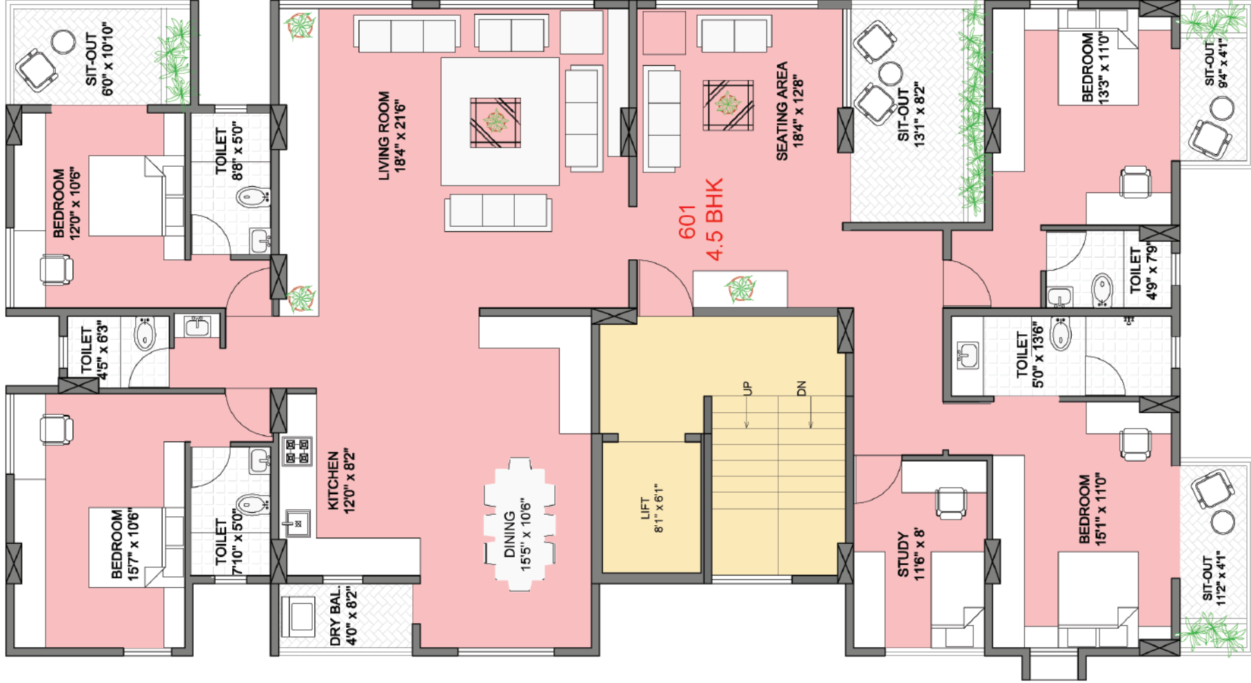
6TH FLOOR PLAN OPTION