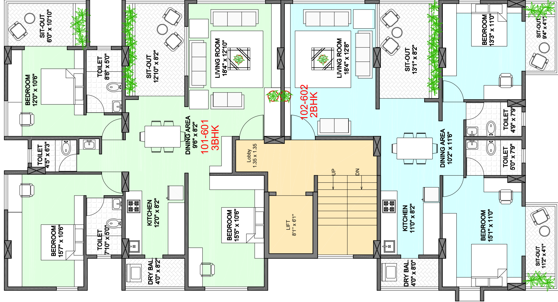
1ST - 6TH FLOOR PLAN